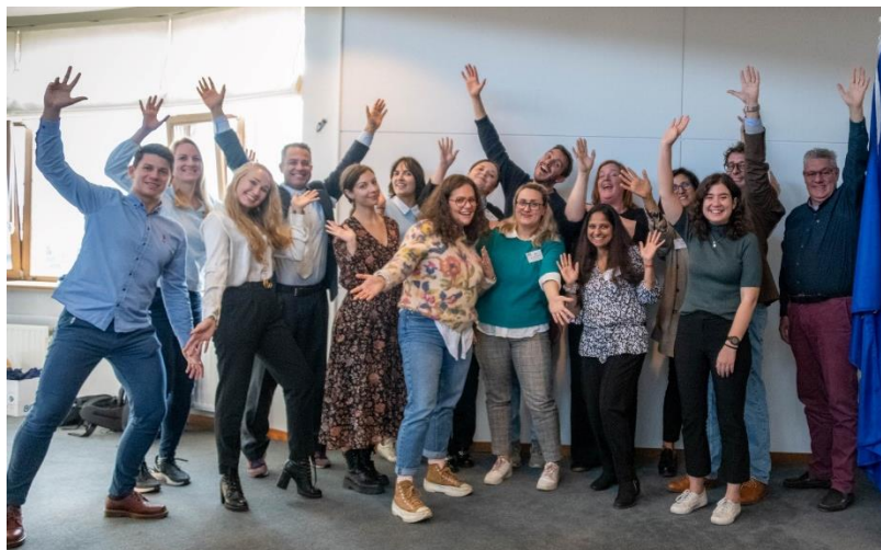
The EntrePubl Partners at the exciting kick-off meeting

Read this article to find out more about our project partners.